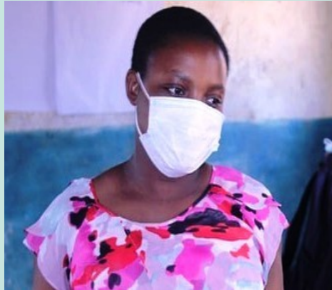
Phalombe YFHS Coordinator

“We have YFHS in our health facilities so its better if we should be meeting and discuss issues that affect us, let’s make use of our Nambazo Health Centre,” she said.