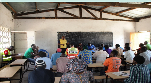
Part of audience at Dindi Primary School in T/A Chiwalu during GBV awareness campaign