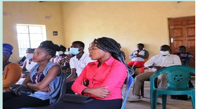
Part of participants during self testing kits distributors review