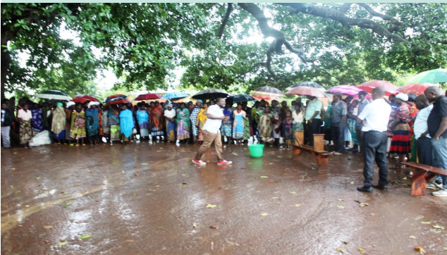
People listening to GBV messages despite rains