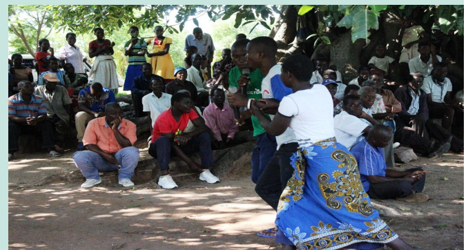
Part of a play by Afikepo youth club in T/A Jenala during GBV awareness campaign