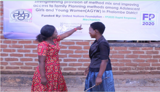
Youth Champions during the refresher training break