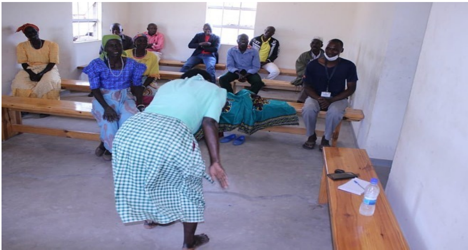
Traditional Counselor demonstrating one of the things they teach young girls during initiation ceremonies

Local leaders in Phalombe district have vowed to end early marriages and sexual Gender Based Violence (SGBV) among women and girls in the district.