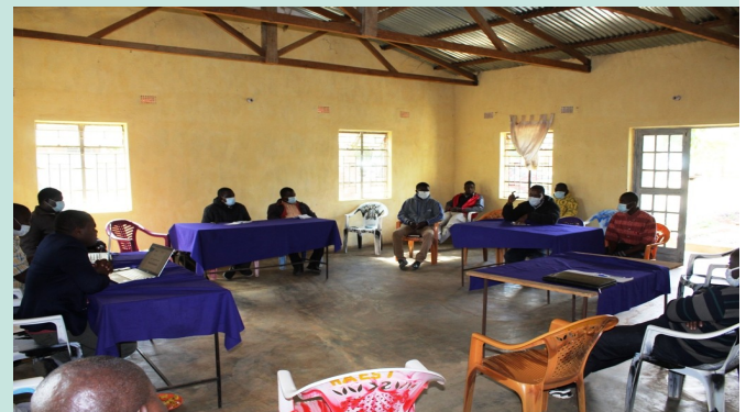
PYAO briefing the councilors on issues arising from the projects