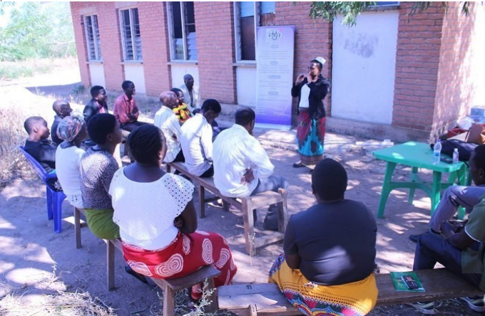
Pic: YCBDAs training in progress at T/A Chiwalo ground

A total of 63 Youth Community Based Distribution Agents (YCBDA's) have been reminded the need of working with other stakeholders for family planning strategies to reach every youth in Phalombe District.